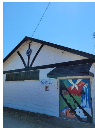
OUTSIDE EXIT DOORS

Bowker Hall is located in Oak Bay at 1709 Monterey Avenue. The hall is next door to Fireman’s Park, the Scout Hall, and the municipal police and fire stations. We are the building closest to the baseball park.